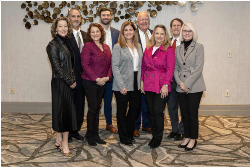
ABA 2023 Board of Directors